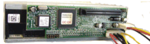
Attach power cable to the converter and the ATAPI device Attach SCSI cable to converter