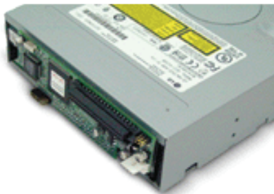
Attach the converter to the connector at the back of any ATAPI device