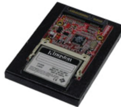
2.5" CF Flash drive