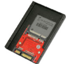
2.5" CFAST Flash drive

3. The Snap-In 25 RAID can be used in any drive kit or equipment that are designed for 3.5" SATA hard drive