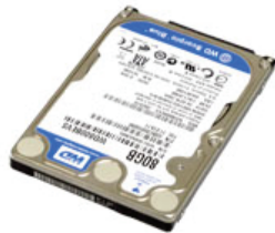
2.5" SATA hard drive

2. Any 2.5" SATA hard drive, SSD or Addonics 2.5" flash drive can be installed into the Snap-In 25 RAID enclosure: