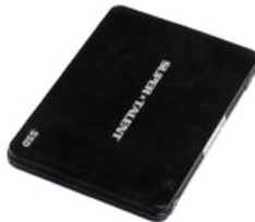
2.5" SSD drive