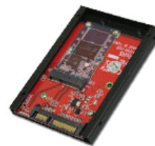
2.5" mSATA Flash drive