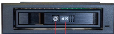
Key Lock Lock Cover