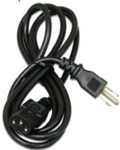
Power Cord (US Version Shown)