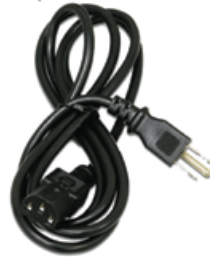
Power Cord (U.S. Version Shown)

WARNING: Please remember to set the power supply to your local outlet voltage prior to plugging in the power cord. Failure to do so may damage the power supply.