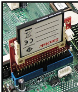
Embedded IDE-CF Adapter (ADEBIDECF)

Install two CF cards directly onto the 40-pin IDE connector on the motherboard