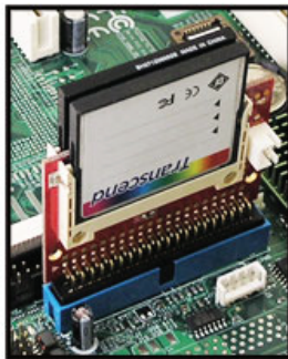
Embedded Dual IDE-CF Adapter (ADEBIDE2CF)

Install two CF cards directly onto the 40-pin IDE connector on the motherboard