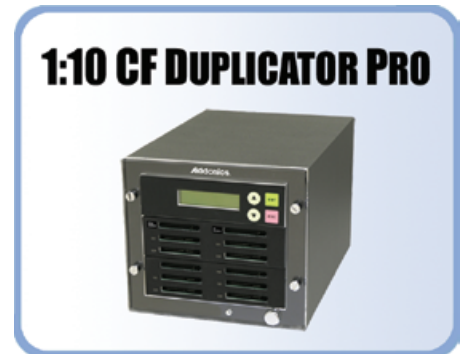
Diagram illustrating duplicator features

This 1:10 CF Duplicator PRO model allows you to copy from one CF or CFast card onto as many as ten CF cards at one time. It is a perfect equipment for content distribution using CF media or for transferring content from CFast card to CF card.