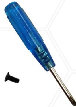
Screwdriver and Spare Screw