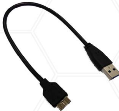
USB 3.0 Cable