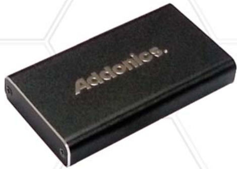
MSATA Flash Drive