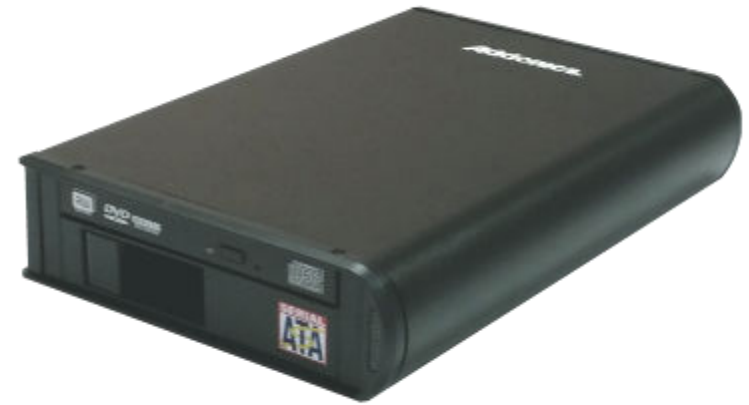
Sapphire Combo DVD-RRW / HDD with eSATA or USB 3.0 (Model: SDVRHEU)